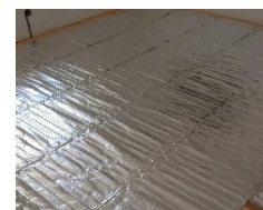
Preparation of the cut